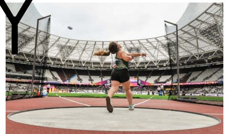
Para Athletics Women Niamh McCarthy, 2017